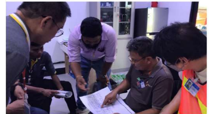
Active Leadership & Problem-Solving Expertise