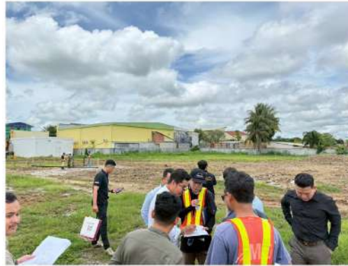
On-site Engineering Leadership

Direct on-site management by experienced project leaders to ensure technical precision. Professional coordination meetings with stakeholders to align on project objectives and timelines.