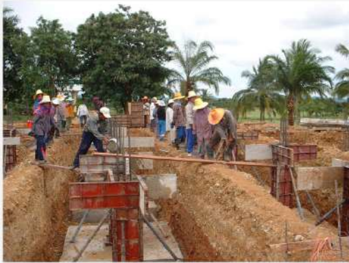
Foundation & Piling