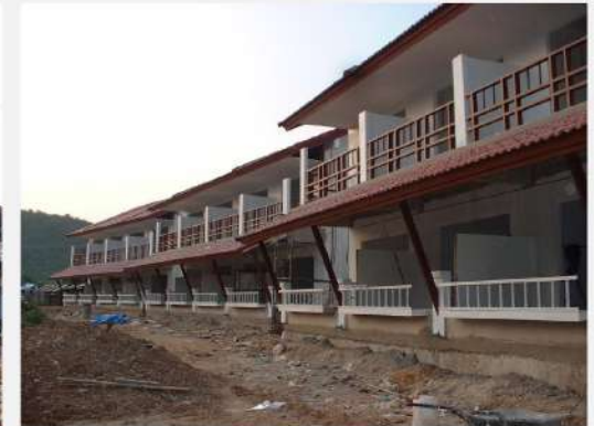
Quality Control & Completion