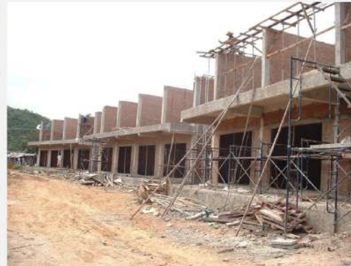
Structural Steel Framing