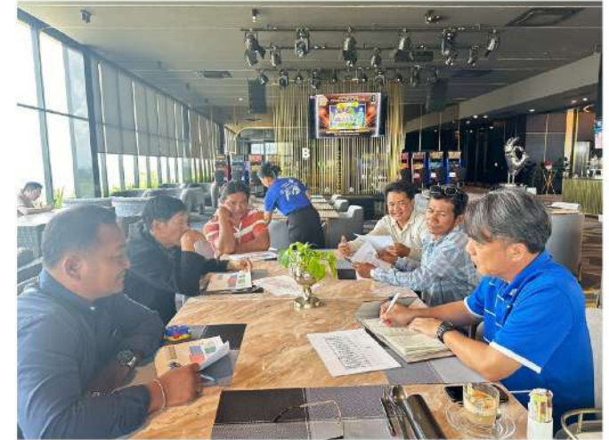
Strategic Project Planning & On-site Quality Audits