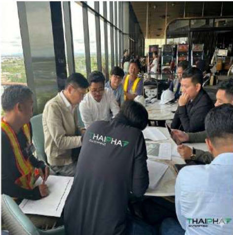
Technical Compliance & Effective Collaboration